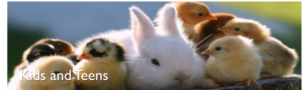
Kids and Teens