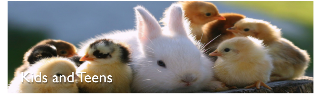
Kids and Teens

Our Core Values - Transformational Truth | Authentic Community Glocal Service | Generous Lifestyle | Holistic Worship